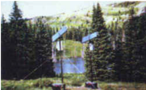
Solar Powered Lake Bed Aeration in action

Lake eutrophication begins when the BOD (Biological Oxygen Demand) of a lake cannot be met. When too much pollution enters a lake, plant and algae growth dies and sinks to the bottom, resulting in an overload of organic sludge. Lower forms of life on the lake bed die and this debris rots. Anaerobic bacteria, which needs no oxygen, give off deadly poisonous gases, such as hydrogen sulfide, ammonia, and methane. These gases, as they rise through the water, unite with and bind up and dissolved oxygen remaining in the water. Fish will then die from lack of oxygen. By pumping compressed air out onto the lake bed diffuser, the rising air bubbles bring the bottom water to the surface. Large volumes of water release pollutant gases to the air and pick up more oxygen while on the surface. If oxygen is present at the lake bed, dead organisms will not accumulate but will quickly be consumed by aerobic bacteria, thus providing for a healthier lake environment.